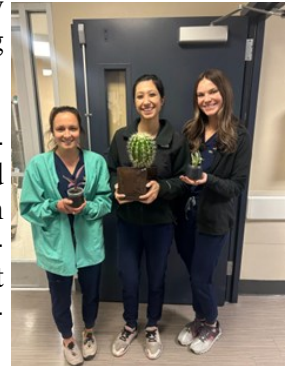
Bringing plants to the doc box

This is also the end of the residency interview season and with that comes having fun with visiting students for second look weekends. We can't wait to meet the next generation of Copa residents!