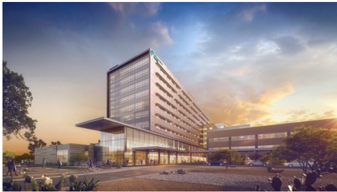
New Valleywise Health Medical Center

Copa has had an eventful winter! We had a full holiday season and are getting ready for the new hospital (anticipated move-in date April 11th). We are excited to practice in the new space while also incorporating our traditional flair.