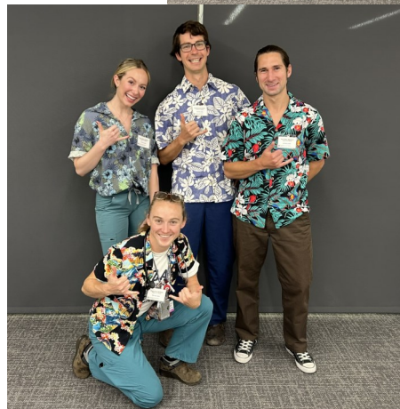
Team UA South