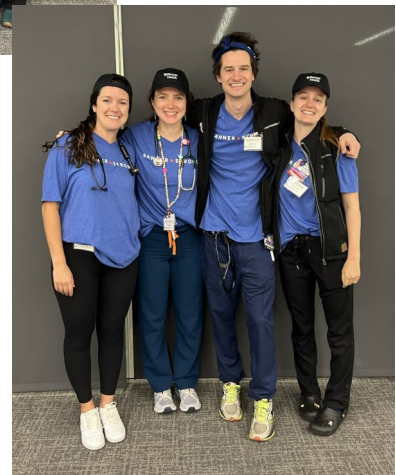
Team UA Tucson