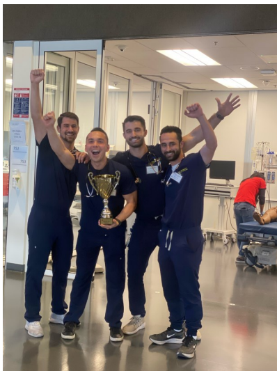
Winners! Team Creighton/Valleywise